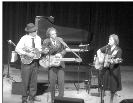
WITH IRIS DEMENT AT THE LEBANON OPERA HOUSE - 12/10/05